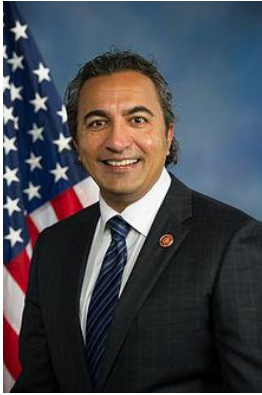
Congressman Ami Bera